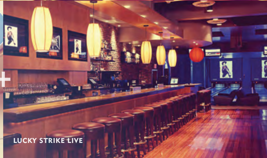
LUCKY STRIKE LIVE