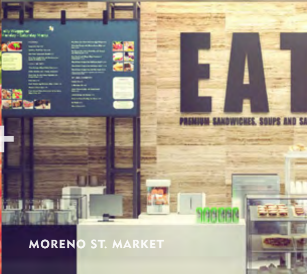
MORENO ST. MARKET