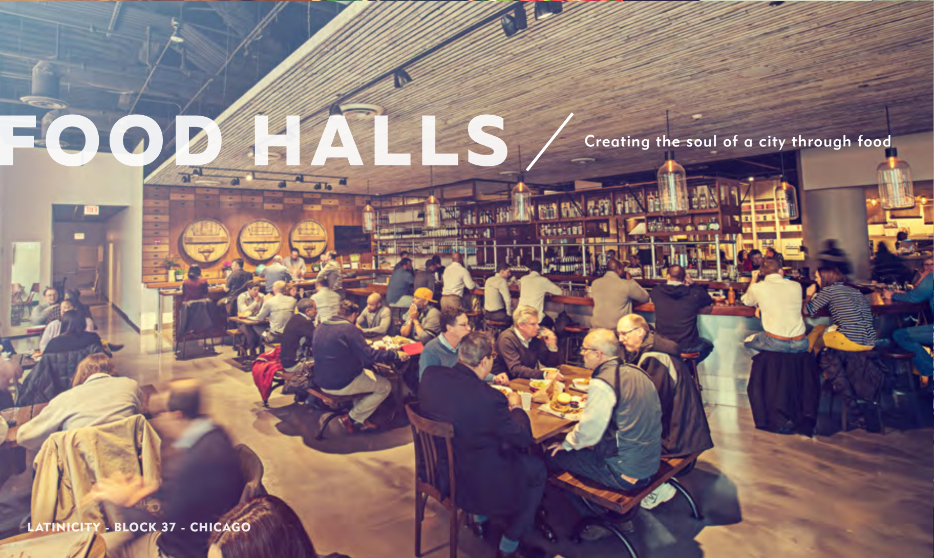
LATINICITY - BLOCK 37 - CHICAGO

Creating the soul of a city through food