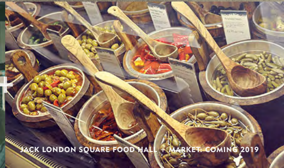
JACK LONDON SQUARE FOOD HALL + MARKET. COMING 2019